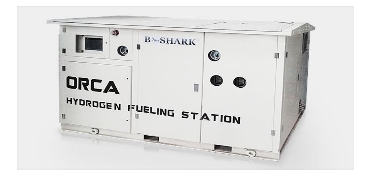
Figure.3. Hydrogen generator

The hydrogen charging station is highly integrated and fully automated, it can generate hydrogen, it is easy to set up, and it uses natural water, it is very easy to operate. The station is independent of atmospheric disturbances and is explosionproof, as well as equipped with an alarm system.